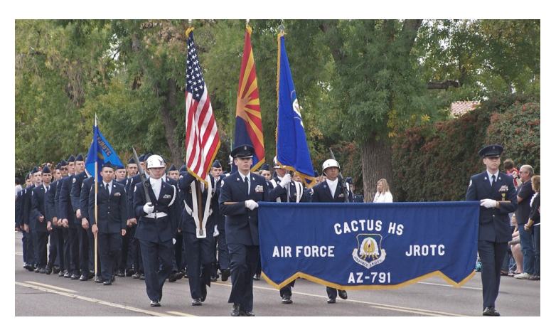
AFJROTC, Cactus High

State MESA Day Champions in Mathematics, Engineering & Science Achievement